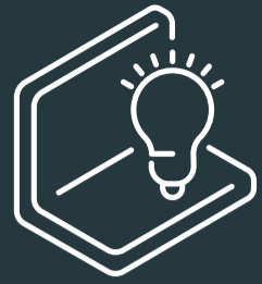
Develop innovative instructional resources