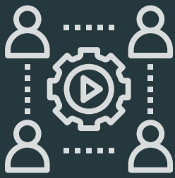
Coach school and district leaders