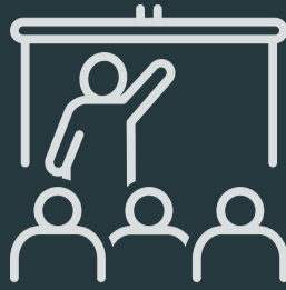
Lead teacher training